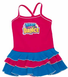
TUTU FRILL DRESS

All READY SET DANCE and READY SET BALLET students will be required to wear the official uniform that we are sure you will love. Below are the following options that can be purchased at reception.