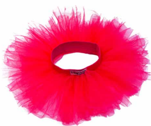
BALLET TULLE SKIRT